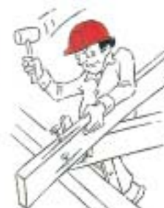
DO FIX IT RIGHT