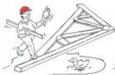
DO STORE ON SITE CAREFULLY

The extra load of a water tank requires careful support. Additional trimmers across the joists support the bearers.