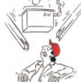
DO SUPPORT YOUR TANK