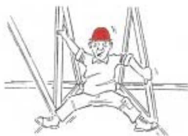
TRUSSES DO NEED BRACING